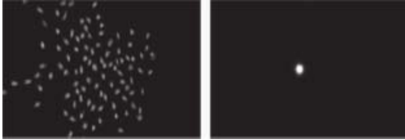
Fig. 3. Pictures showing the focussing of the mirror segments with a \sim 1 km distant lamp. Left: spots of the 103 panels before the adjustment. Right: common spot after focussing.