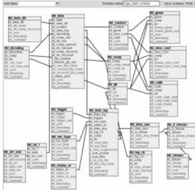
Fig. 2. DB production schemaArgo.

formation, missing files, etc) are filled during the first phase. The reconstructed data info (files, their location, version of the program, errors, etc) are stored in the production DB at the end of the second phase. The ‘‘standard’’ analysis performed on the data are also registered in the DB. Many other tools, to refine the data analysis, as well as to monitor and to face emergencies during the data processing, are under development.